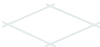
1. Bare stand

Equipped stand 3 400€ HT x sqm = € EX VAT