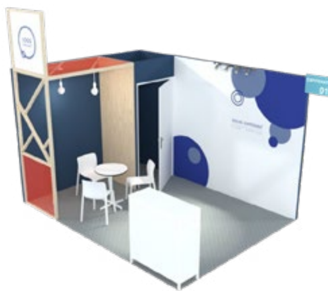
turnkey stand elaborate shown here in blue and orange. Also available in yellow.